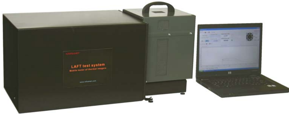
Fig. 1. Photo of the LAFT measuring set