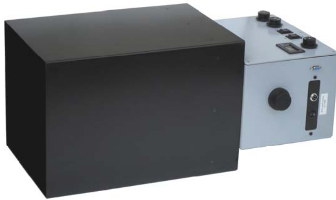
Fig. 1. Photo of the LOF measuring set