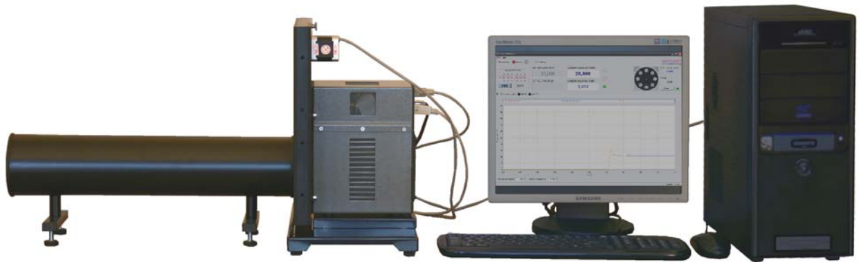
Fig. 1. Photo of the SAFT measuring set