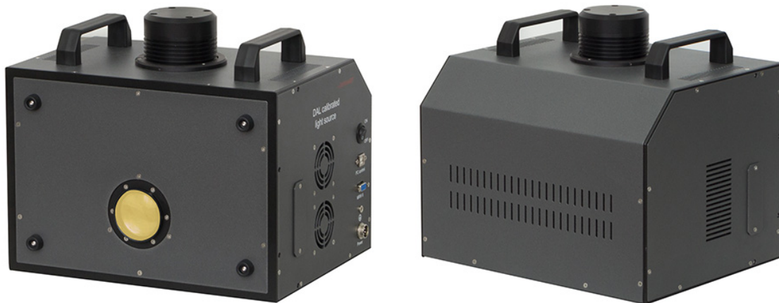
Fig. 2. Photos of DAL calibrated light source front view and back view