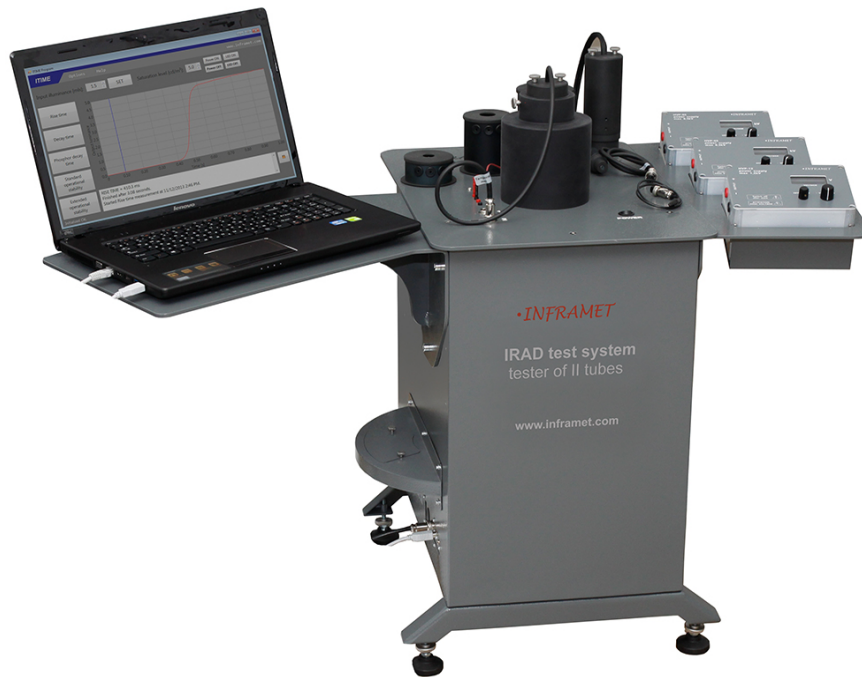
Fig. 1. Photo of IRAD test station

Station for measurement of radiometric/temporal parameters of II tubes