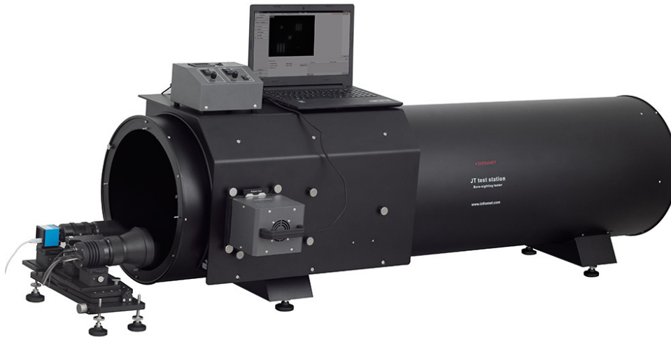
Fig. 1. Photo of the JT400 boresight station