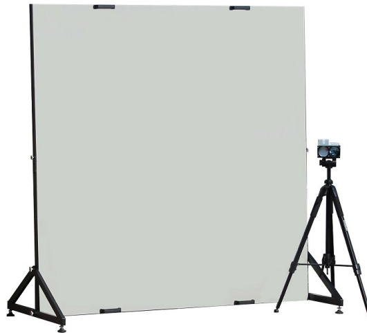
Fig. 1. Photo of the LAS test station