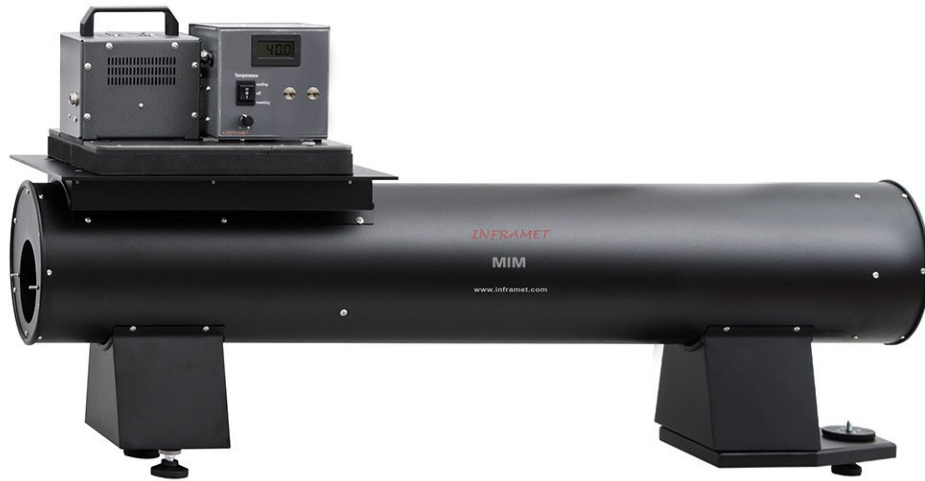
Fig. 1. Photo of MIM110 test system