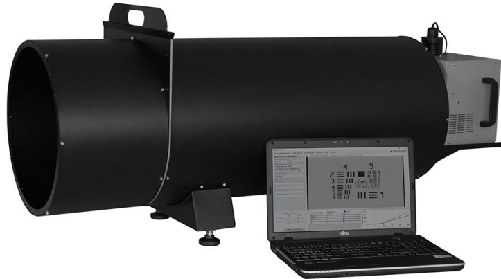
Fig. 1. Photo of the LOF measuring set