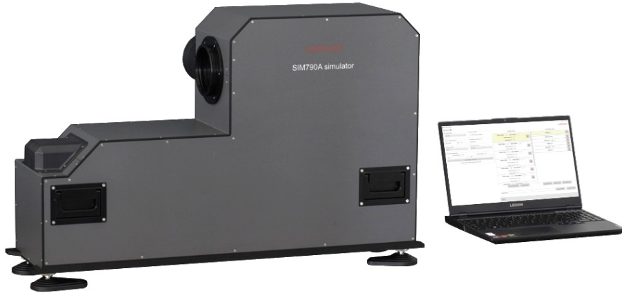
Fig. 1. Photo of SIM790 simulator