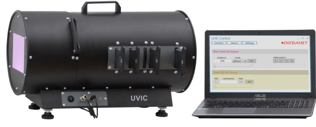
Fig. 1. Photo of UVIC test station